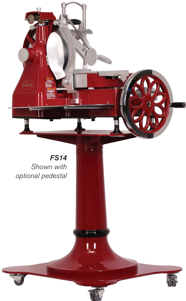
FS14 Shown with optional pedestal

This vintage design accommodates traditionally over-sized artisan meats for theater-style, paper-thin slicing with effortless operation.